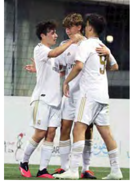
Al Kass International Cup