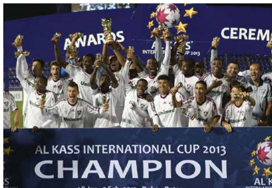
2013 FLUMINENSE FC