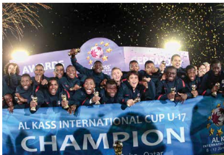
2012 PARIS SAINT-GERMAIN