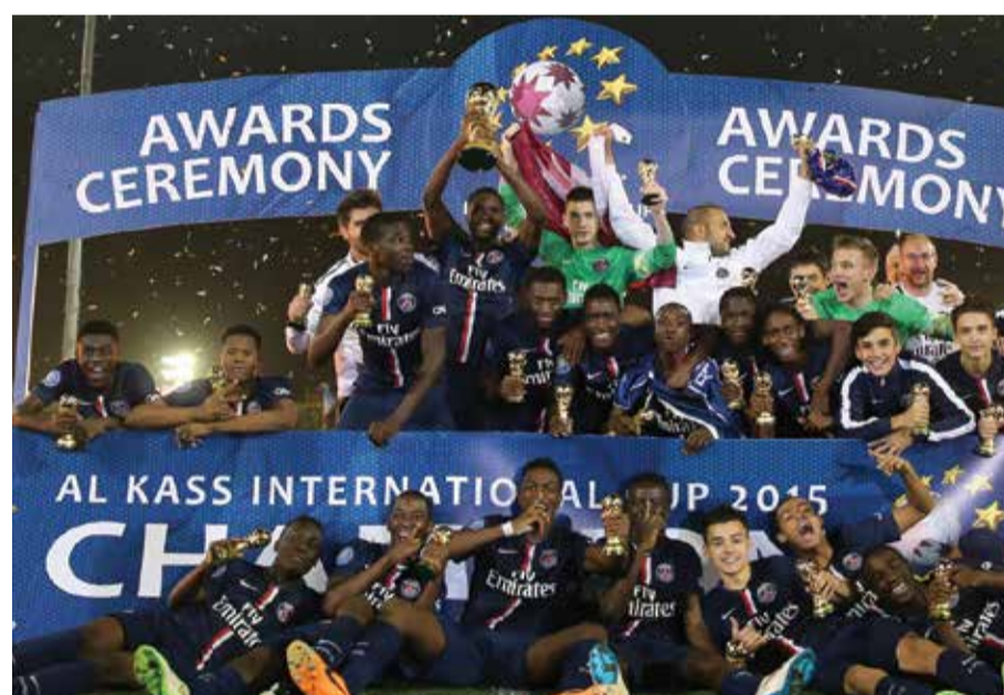
2015 PARIS SAINT-GERMAIN