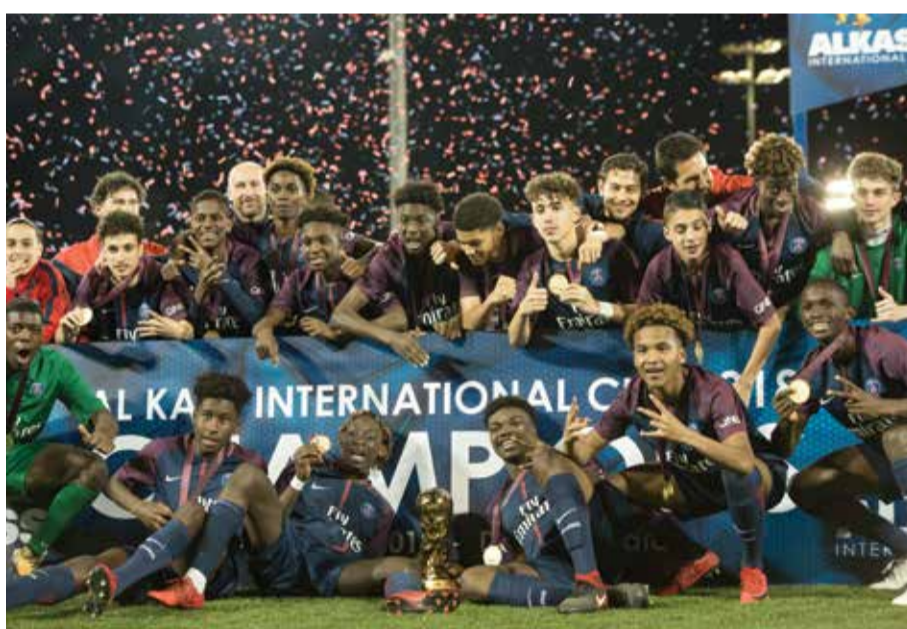
2018 PARIS SAINT-GERMAIN