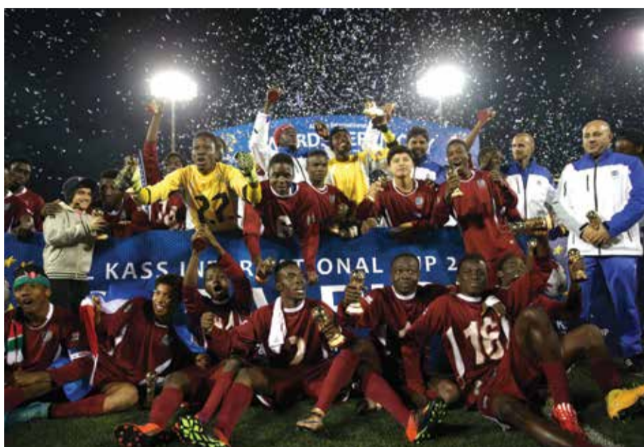
2016 ASPIRE FOOTBALL DREAMS