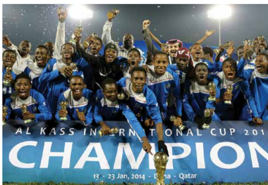
2014 ASPIRE INTERNATIONAL