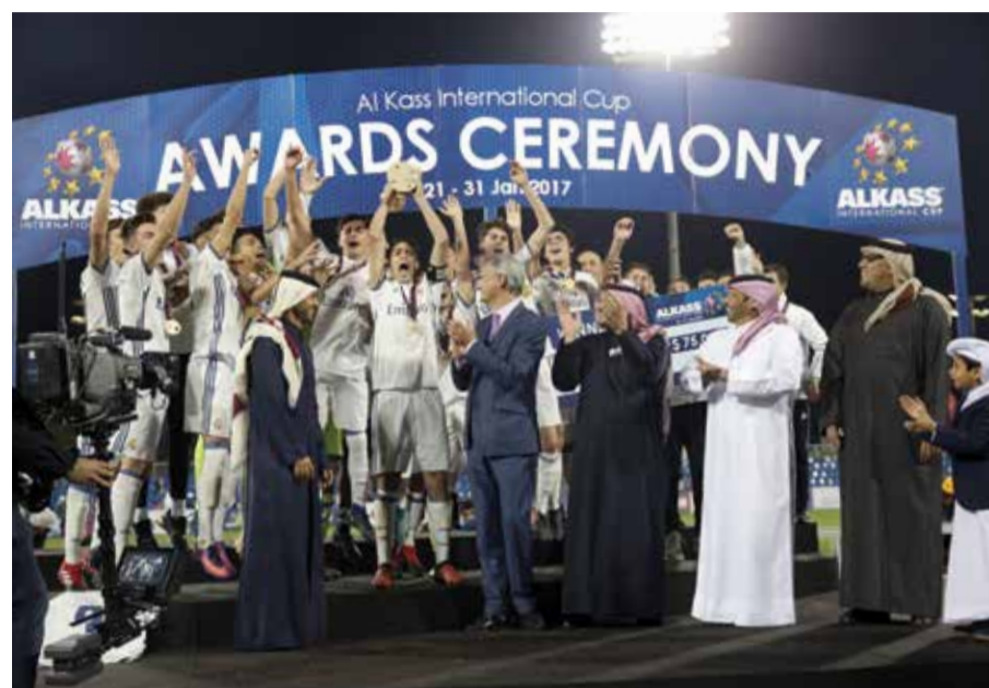
2017 REAL MADRID FC