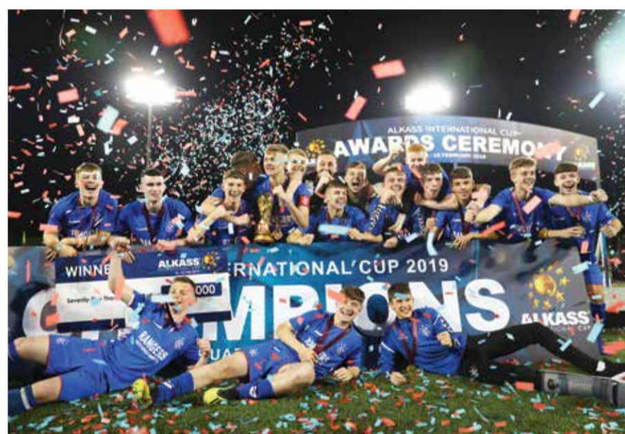
2019 RANGERS FC

WHO WILL BE THE WINNER OF AL KASS INTERNATIONAL CUP 2020?